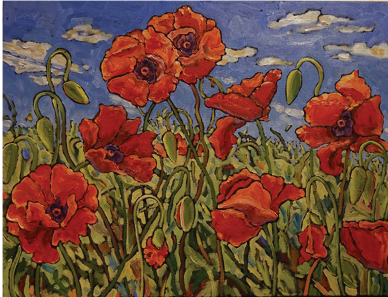
Poppies Blue Sky Lori Lynn Hoffer