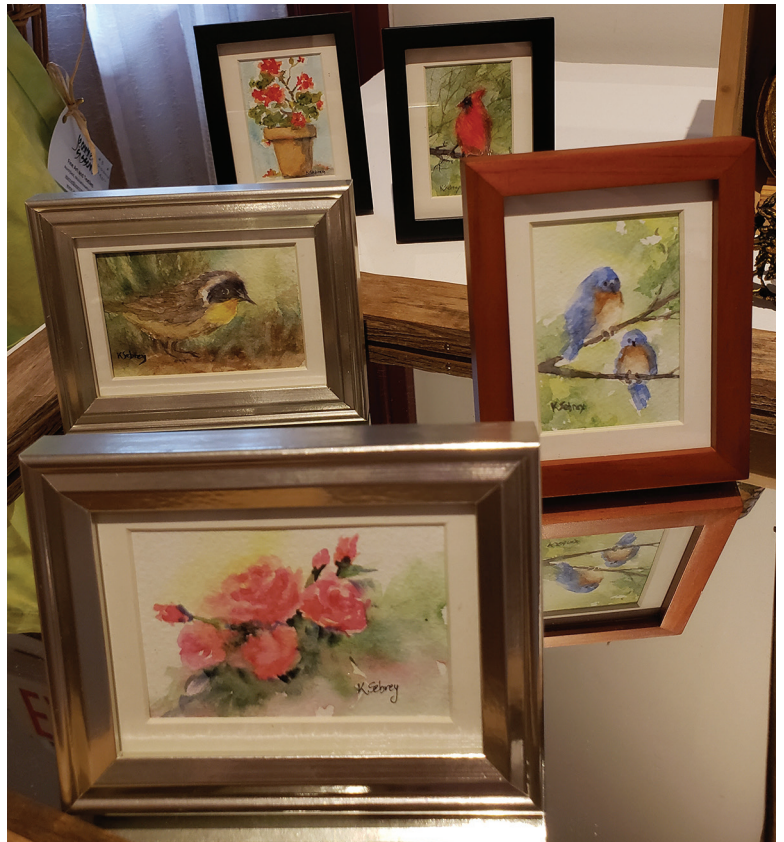
Petite Original Paintings Kimberly Sebrey