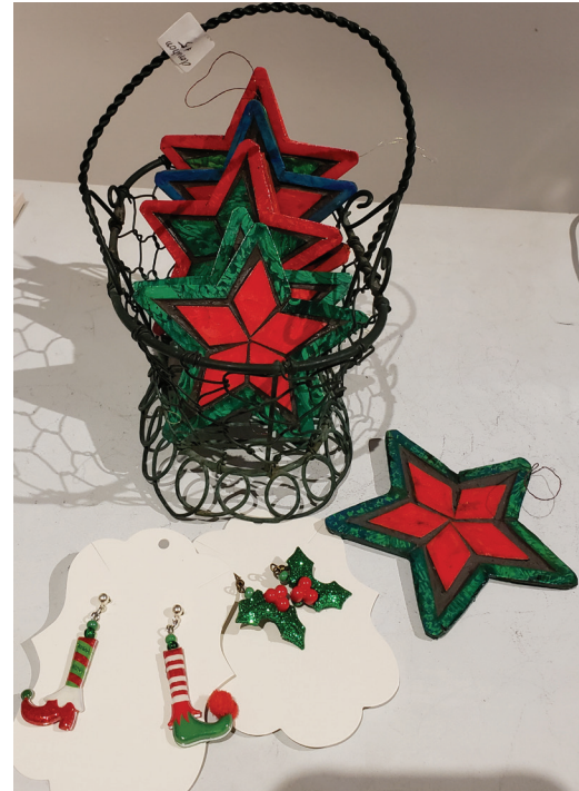
Penny. Pitts Holiday Stars and Earrings