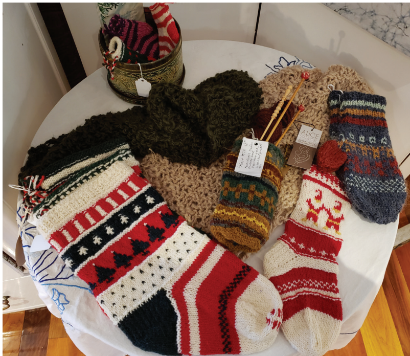
Renee Busch Knit stockings and mittens